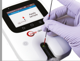
Step 3 Dispense sample onto test strip