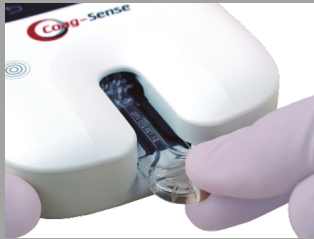
Step 1 Insert a test strip