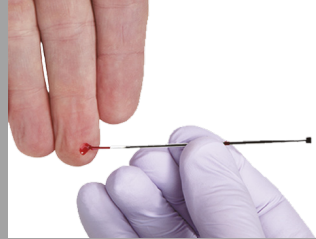
Step 2 Lance finger and collect a bead of blood with in- cluded transfer tube