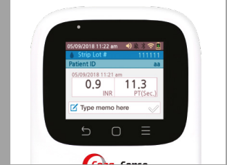
Step 4 Wait for results (testing time is the patient's actual clotting time)