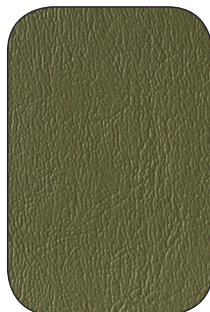
Ivy (30) PR53