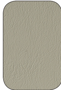
Feather (23) PR37