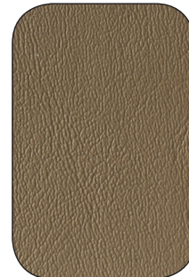
Cocoa (28) PR51