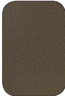
Gunmetal (22) PR92