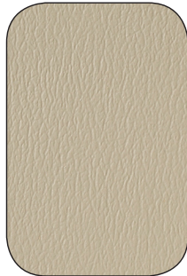
Clamshell (21) PR57

For Procedure and Exam Tables & Medical Exam Seating