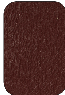
Cabernet (27) PR36