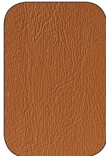
Saddle (25) PR52