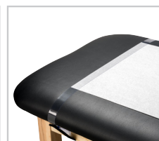
040 Paper Cutter