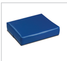
020 Small Pillow