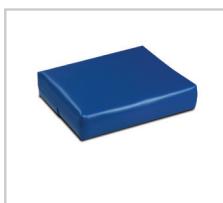
020 Small Pillow