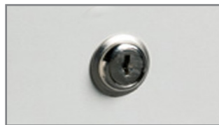
055 Door Locks