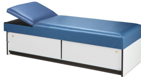
3770-15 w/Flat Foam Adjustable Headrest