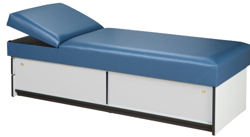
3770-16 Adjustable pillow wedge headrest