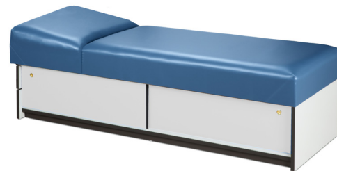
3770-10w/Non-Adjustable Pillow Wedge