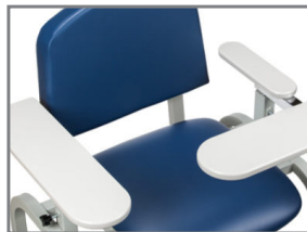
665 ClintonClean™, Armrests and Flip Arm(s)