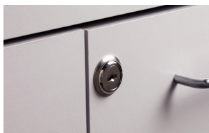
055 Door Locks