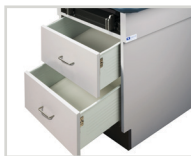
2 drawer storage