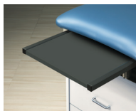
Pull-out, slate, laminate, leg rest