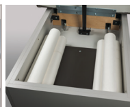
Paper Roll Storage