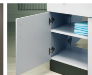
Both Sides Access