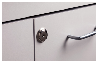
055 Door & Drawer Locks