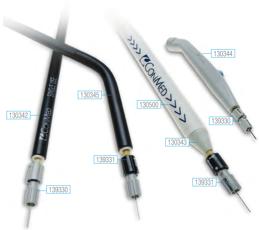
ABC® Handpieces Compatible with Dissecting Electrodes

ABC® Dissecting Electrodes combine the benefits of argon gas with a tungsten electrode. This combination of electro-surgical modality provides a blend of cut and coagulation effects that may result in a cleaner cut with hemostasis.