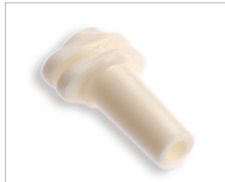
Washing Plugs for Screw Connector Cuffs Compatibility: GE DINAMAP Part # 300877 (Qty: 50)