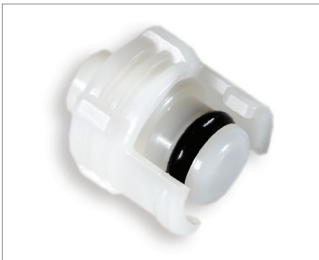
Washing Plugs for Submin Connector Cuffs Compatibility: GE, GE Marquette, Protocol Part # 330072 (Qty: 50)

GE Healthcare provides wash plugs that block water from entering the BP cuff during cleaning.