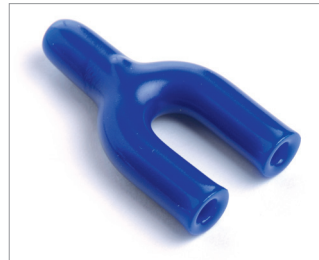
Y, 1 Unfitted to 2 Unfitted Compatibility: Unfitted Part # 300829 (Qty: 1)