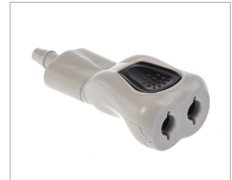
1T DINALICK Female Recept for single lumen hoses Compatibility: DINACLICK Male Plug Part # 2055630-001 1/8" tube (Qty: 10)