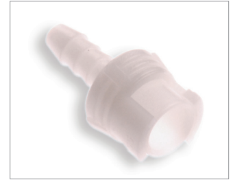
Female Submin to 1/8" ID Barbed, Plastic Compatibility: GE, GE Marquette, Protocol Part # 330064 (Qty: 10)