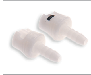
Mated Pair Submin to 1/8" ID Barbed, Plastic Compatibility: GE Datex-Ohmeda Part # 330058 (Qty: 10)