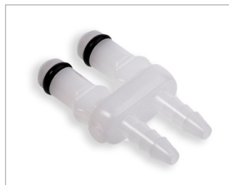
2T Neo-Snap Male Plug 0.33 Centers Compatibility: Neo-Snap Female Part # 2059293-002 (Qty: 10)