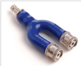
Y, 1 Male Bayonet to 2 Female Screw Connectors Compatibility: Philips/HP, Siemens, Datascope, Colin Part # 330046 (Qty: 1)