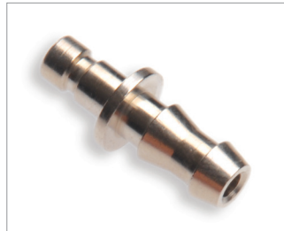
Male Bayonet to 3/16" ID Barbed, Metal Compatibility: Philips/HP, Siemens, Datascope, Colin Part # 330059 (Qty: 10)