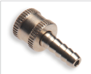
1/8" ID Barbed to Female Screw, Metal Compatibility: GE DINAMAP Part # 300619 (Qty: 2)