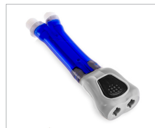
X, 2 Male Screw to DINACLICK Female Recept