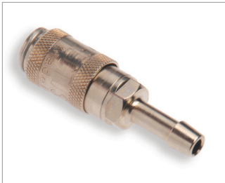
5/32" ID Barbed to Female Bayonet, Metal Compatibility: Philips/HP, Siemens, Datascope, Colin Part # 330060 (Qty: 10)