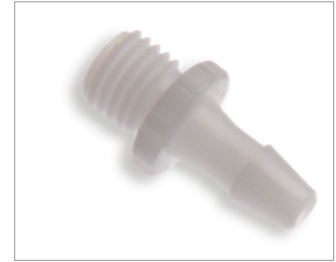
Male Screw to 5/32" ID Barbed, Plastic Compatibility: GE DINAMAP Part # 300664 (Qty: 10)