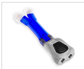
X, 2 Female Submin to DINACLICK Female Recept