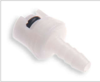
Male Submin to 1/8" ID Barbed, Plastic Compatibility: GE, GE Marquette, GE Datex-Ohmeda Part # 330091 (Qty: 10)