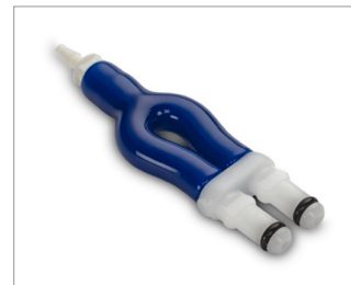
Y, 1 Male Barb 3/32" to Neo-Snap Male Plug