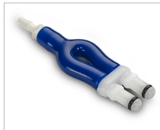
Y, 1 Male Barb 1/8" to Neo-Snap Male Plug