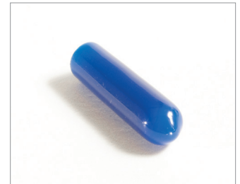
Washing Plugs for Neo-Snap Female Recept and DINACLICK Male Plug Compatibility: GE Part # 2059295-001 (Qty: 50)