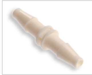
5/32" ID Barbed to 5/32" ID Barbed, Plastic Compatibility: Airhose Connector Part # 300670 (Qty: 10)