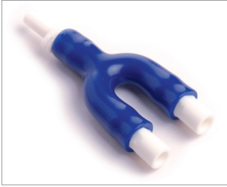
Y, 1 Male Slip Luer to 2 Female Slip Luers-Neonatal Compatibility: Philips/HP, Siemens, Datascope, Spacelabs Part # 330049 (Qty: 1)