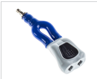
Y, 1 Male Bayonet to DINACLICK™ Female Recept

Compatibility: Philips/HP, Siemens, Datascope, Colin