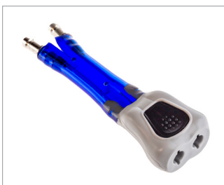
X, 2 Male Bayonet to DINACLICK Female Recept