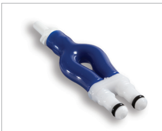
Y, 1 Male Slip Luer to Neo-Snap Male Plug

Compatibility: Philips/HP, Siemens, Datascope, Spacelabs