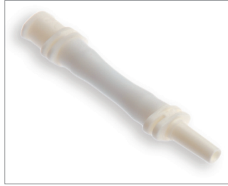
1 Male Micro Plug to 1 Female Locking Luer-Neonatal Compatibility: Spacelabs Part # 330088 (Qty: 10)