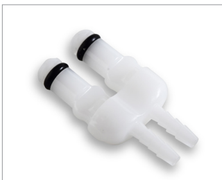
2T Neo-Snap Male Plug 0.22 Centers Compatibility: Neo-Snap Female Part # 2059293-001 (Qty: 10)