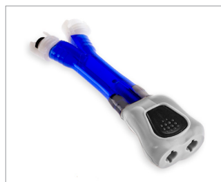
X, 2 Mated Submin to DINACLICK Female Recept