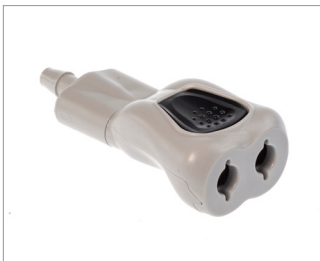
1T DINACLICK Female Recept for single lumen hoses Compatibility: DINACLICK Male Plug Part # 2055630-002 5/32" tube (Qty: 10)