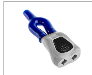
Y, 1 Unfitted to DINACLICK Female Recept