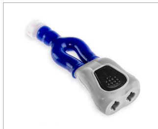
Y, 1 Female Submin to DINACLICK Female Recept