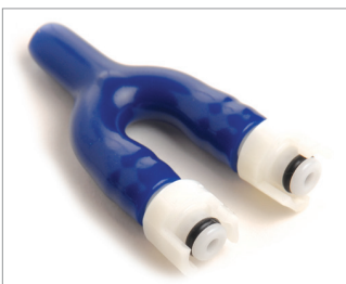
Y, 1 Unfitted to 2 Male Submins Compatibility: Unfitted Part # 330084 (Qty: 10)