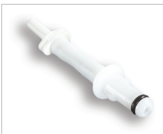
Male Micro Plug to 1 Neo-Snap Male Plug