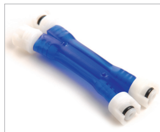
X, Mated Pair Submins to 2 Male Submins Compatibility: GE Datex-Ohmeda Part # 330085 (Qty: 10)