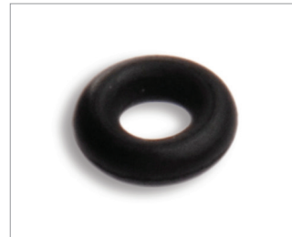
O-Ring Replacement Set for Air Hose Instrument Connector Compatibility: (330073) and Air Hoses (107365, 107368, 107366) Part # 330077 (Qty: 20)