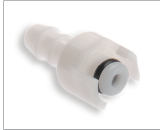
Male Submin to 5/32" ID Barbed, Plastic Compatibility: GE, GE Marquette, GE Datex-Ohmeda Part # 330090 (Qty: 10)