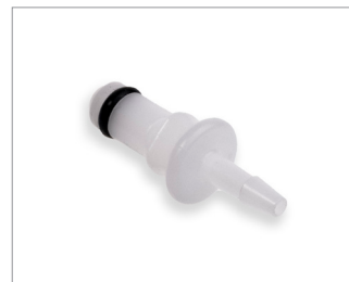
1T Neo-Snap Male Plug Compatibility: Neo-Snap Female Part #2059293-003 (Qty: 10)