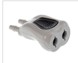
2T DINACLICK Female Recept to 1/8" ID tubing, dual lumen hoses Compatibility: DINACLICK Male Plug Part # 2059294-001 (Qty: 10)