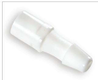
5/32" ID Barbed to Female Slip Luer Compatibility: Universal Neonatal Part # 330068 (Qty: 10)