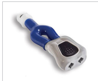
Y, T Male Submin to DINACLICK Female Recept