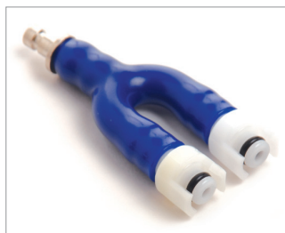
Y, 1 Male Bayonet to 2 Male Submins Compatibility: Philips/HP, Siemens, Datascope, Spacelabs Part # 330080 (Qty: 10)