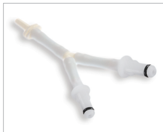
Male Micro Plug to 2 Neo-Snap Male Plug