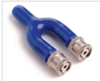
Y, 1 Unfitted to 2 Female Screw Connectors Compatibility: Unfitted Part # 330048 (Qty: 1)