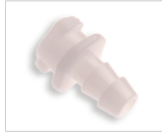
Female Submin to 5/32" ID Barbed, Plastic Compatibility: GE, GE Marquette, GE Datex-Ohmeda Part # 330092 (Qty: 10)