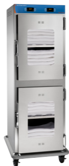
Shown with optional bumper