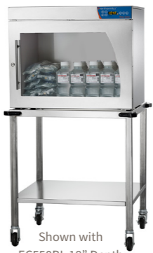
Shown with EC550BL 18" Depth Combination Warmer