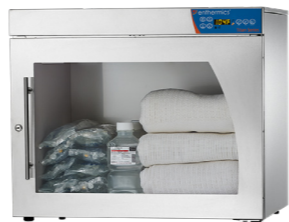
Unit shown with fluid bottles, bags and blankets for illustration purposes only