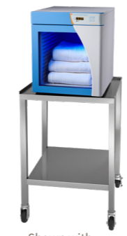
Shown with DC250 Blanket Warmer