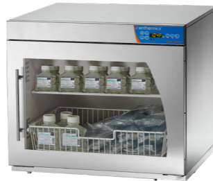
Unit shown with optional basket - set up for fluids