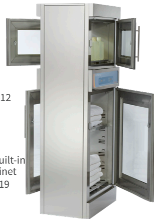
Shown as optional pass-through cabinet