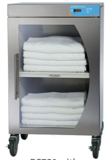
EC750 with optional casters