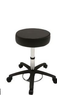
Model 21340 in Black

21340V - 16" (40.6 cm) vacuum formed seat