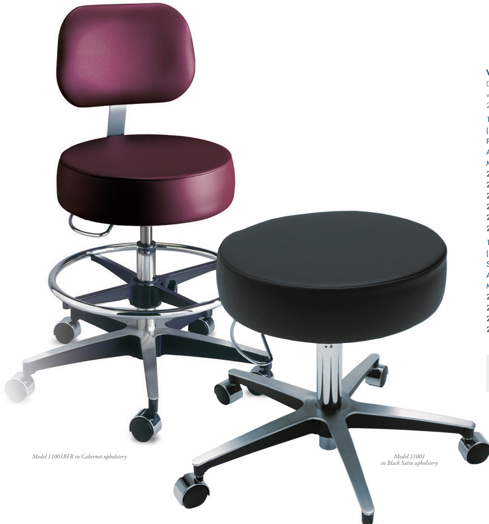
Model 11001BFR in Cabernet upholstery

B - Backrest FR - Footring V - Vacuum formed/Seamless LCD - Locking casters G - Glides C133 - CAL-133 upholstery UL - Ultraleather™ upholstery