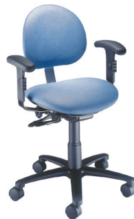
Model 21435BA in Azure Blue