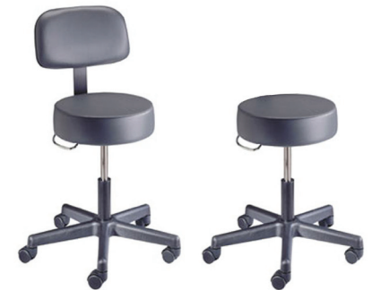
Model 22500B in Ash