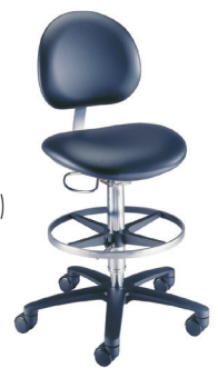
Model 21521B in Adriatic