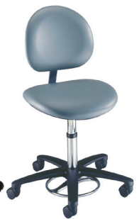
Model 21340B in Wedgewood