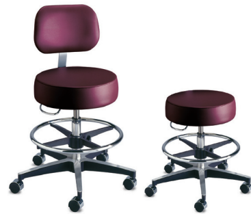
Model 11001BFR in Cabernet