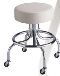
Model 23051 in Arctic