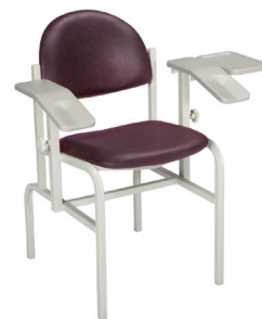
Model 1500 in Cabernet