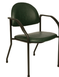
Model 1200 in Ivy