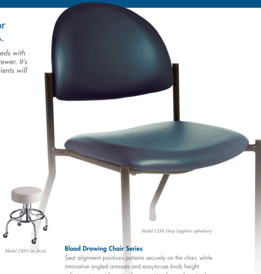
Model 1250 Deep Sapphire upholstery