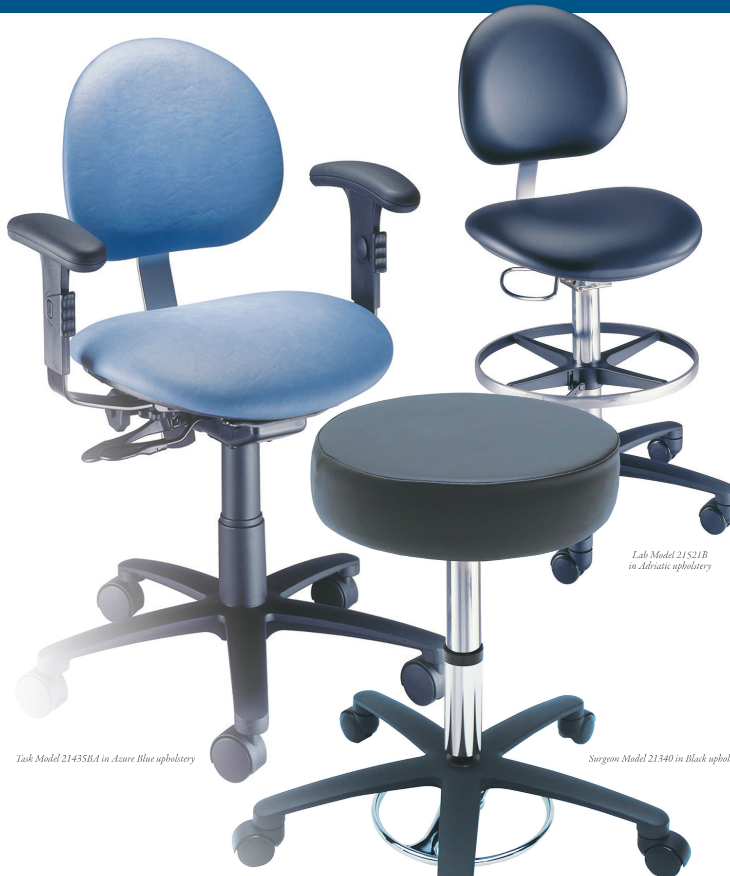
Lab Model 21521B in Adriatic upholstery