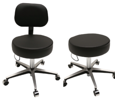
Model 11001B in Black