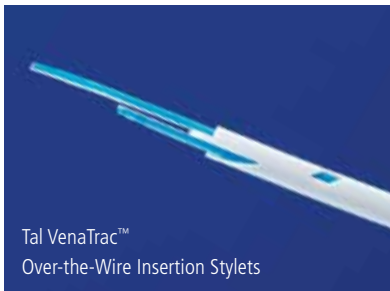
Tal VenaTrac™ Over-the-Wire Insertion Stylets