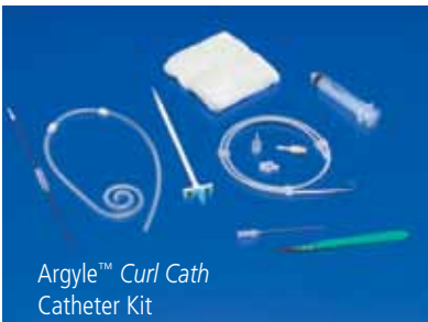
Argyle™ Curl Cath Catheter Kit