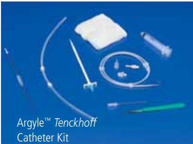
Argyle™ Tenckhoff Catheter Kit