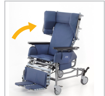
Tilt-in-Space functionality allows easy repositioning of users