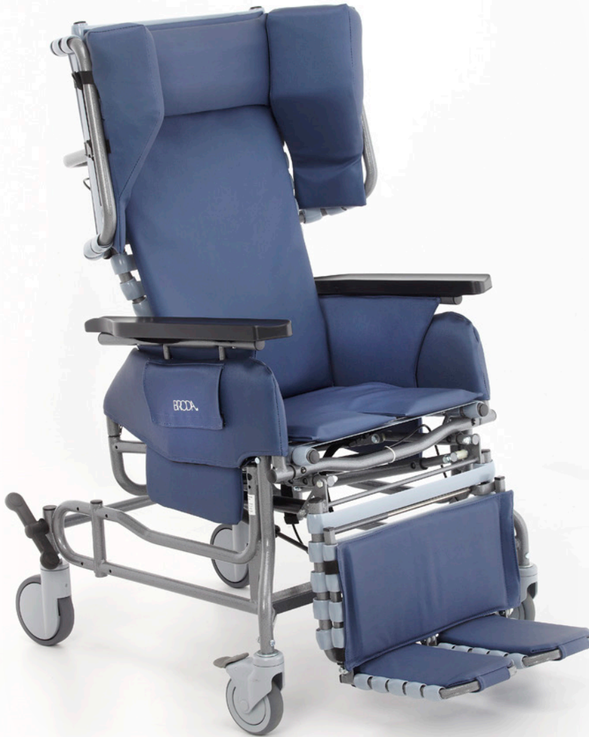
Shown with 6" Multi-Directional Locking Rear Casters, and long armrests options