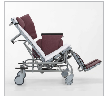
Posterior Tilt effectively opens the diaphragm improving digestion, oxygenation, and organ function