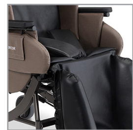
Padded Thigh Strap

Additional accessories available: foot supports, trays, and positioning straps