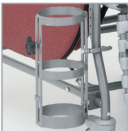
O 2 Holder