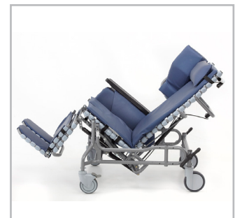
Removable armrests make transfers safer for caregivers and patients