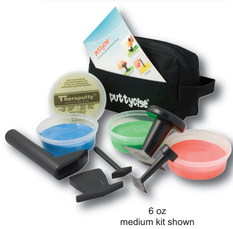
6 oz medium kit shown