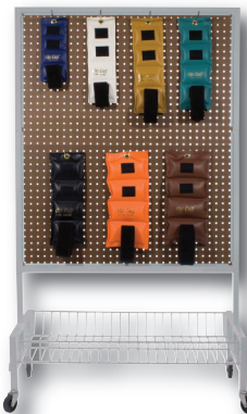
weights sold separately