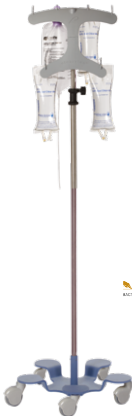
P-1080-CV Height adjustable from 71" to 124"