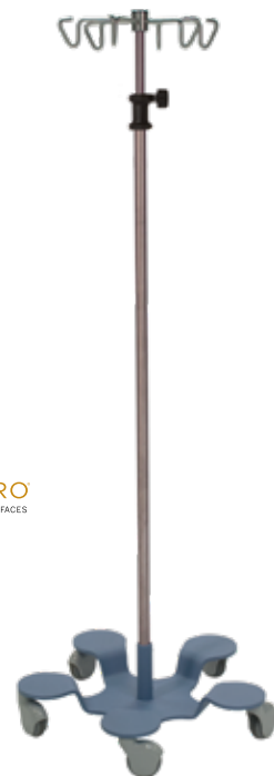
P-1080-6 Height adjustable from 72½" to 124"