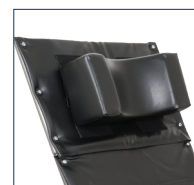
13-inch headrest supports patient when reclined and is removable