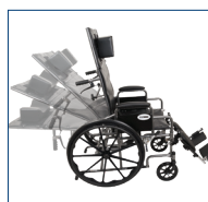
Reclines from 90° – 160°

The ProBasics Reclining Manual Wheelchair provides full back and headrest support as patient reclines from 90 to 160 degrees. The 13-inch headrest and padded, full-length arms are removable. Black, padded vinyl upholstery resists mildew and bacteria. The frame has a chip-resistant silver vein finish. Mag-style wheels are lightweight and set back on frame to prevent patient from tipping when in the reclined position.